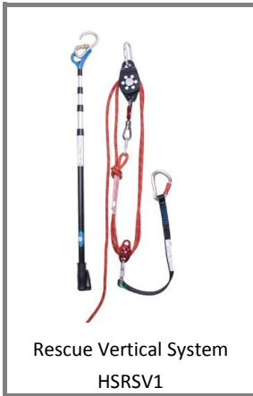
Rescue Vertical System HRSV1