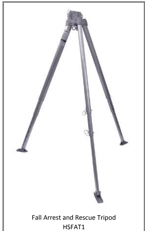
Fall Arrest and Rescue Tripod HSFAT1