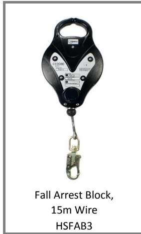
Fall Arrest Block, 15m Wire HSFAB3