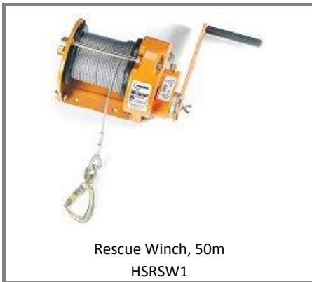
Rescue Winch, 50m HRSRW1