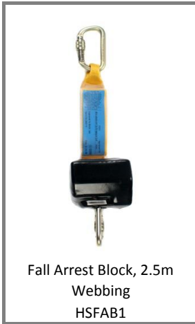
Fall Arrest Block, 2.5m Webbing HSFAB1

fall arrest and rescue equipment (see RD617 for restraint equipment)