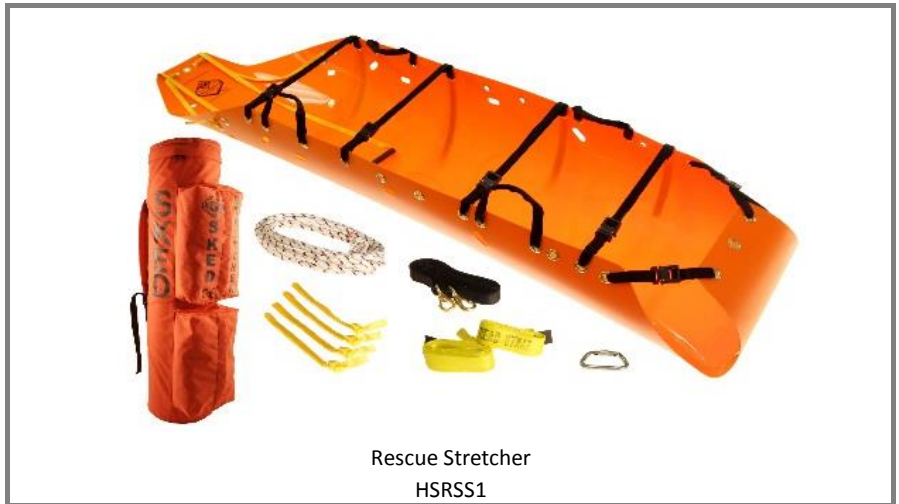
Rescue Stretcher HSRSS1