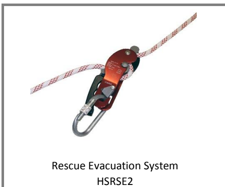
Rescue Evacuation System HSRSE2

Fall arrest block repair, test and certification service available